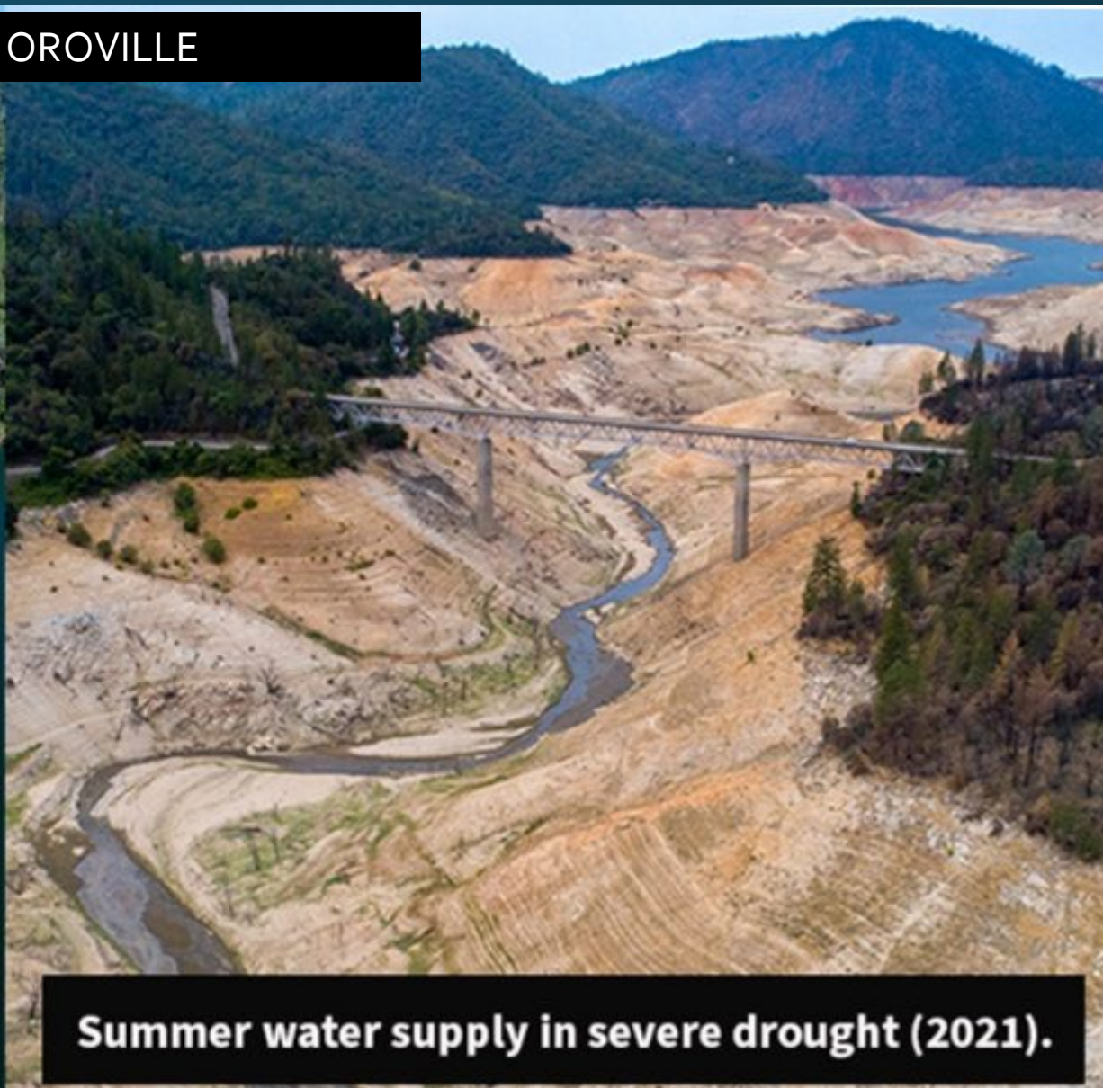
Summer water supply in severe drought (2021).