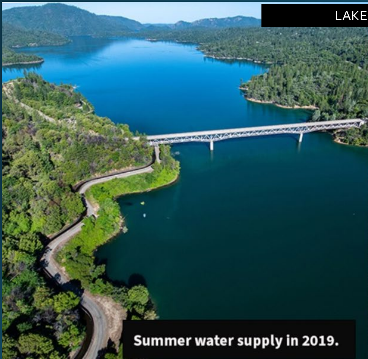
Summer water supply in 2019.