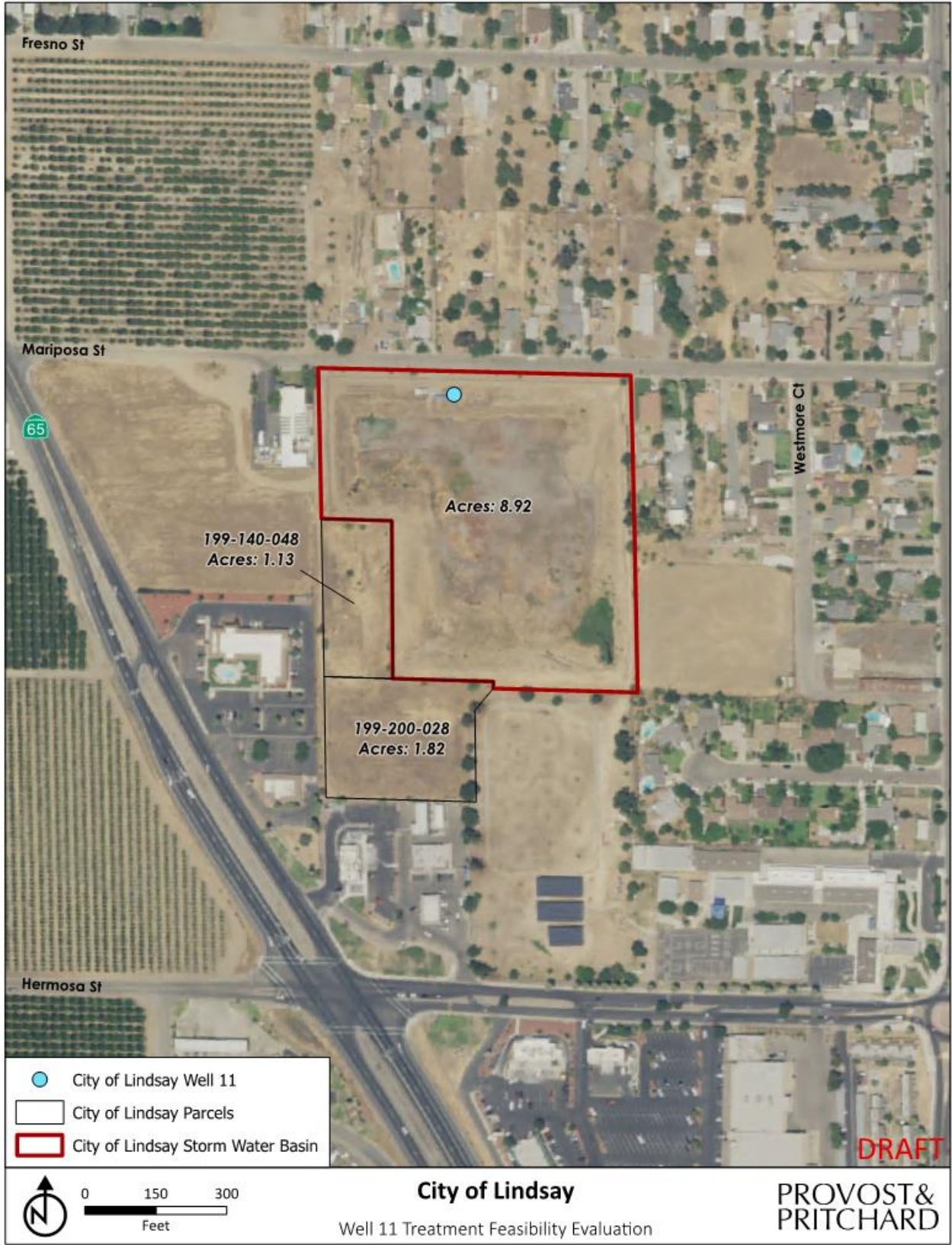
Figure 3-2: Well 11 Vicinity Map and City Property